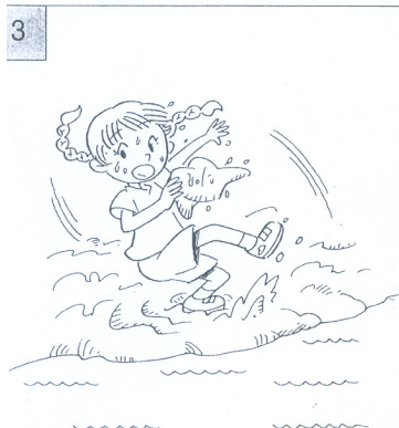
wash / face