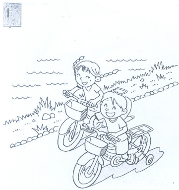
ride / bicycles

At last, we rode our bicycles and went back home happily.