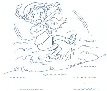
wash / face